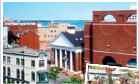
Downtown Portland, Maine