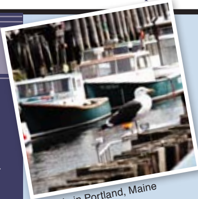
Seaside in Portland, Maine